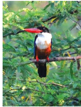
Black Capped Kingfisher.