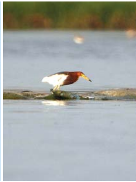
Chinese Pond Heron.

The return migration season always springs a lot of surprises every season. Following the Black Stork ( Ciconia nigra ) is another species which sulks around mangroves and scrubs close to the backwaters hunting crab/fish/frog/insects. It is less often seen and seldom photographed. We sighted a Black Capped Kingfisher ( Halcyon pileata ) in the scrub near Kelambakkam backwaters. As it