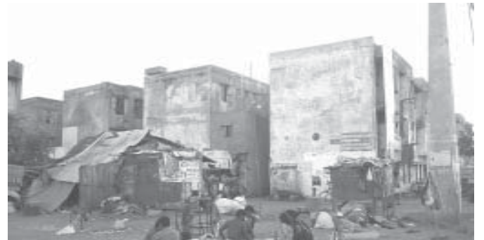
The fisherfolks' tenements due for replacement.

This is not the first time that the Government has viewed the