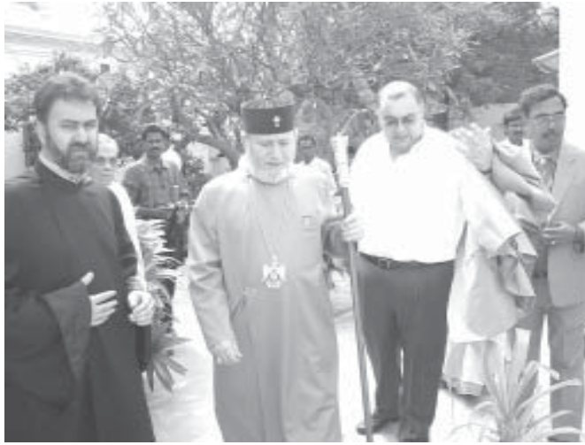
Catholicos Karekin II at the courtyard of the Armenian Church.

The Armenian Church on the eponymous street in George Town has seen no service for