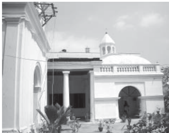
The Armenian Church.

Let us hope that all this augurs well for the Armenian Church, an important heritage structure in the city. And perhaps when the Catholicos returns on an official visit, the bells will peal again.