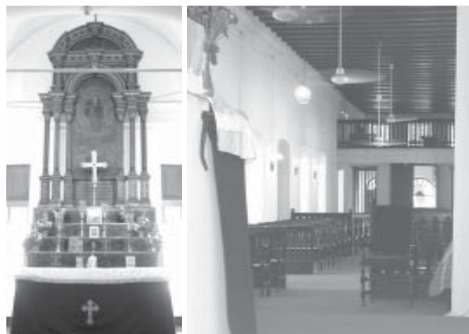
The altar and the nave.

On March 2nd, however, all was hustle and bustle inside the church as it prepared itself for the visit of the Catholicos. It is always amazing to see how a simple lime wash can brighten up a heritage building and the church was no exception. Inside, the altar rails gleamed. The tomb of Shimovinian who in Madras began Azdarar , the first Armenian publication worldwide, had been cleaned and a bouquet of flowers placed on it. The only element missing was