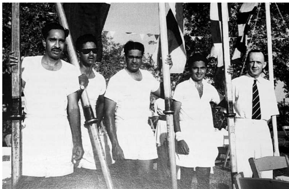
Above: An oarsman too – seen extreme left. Below: Leading Indianisation at the MCCI.