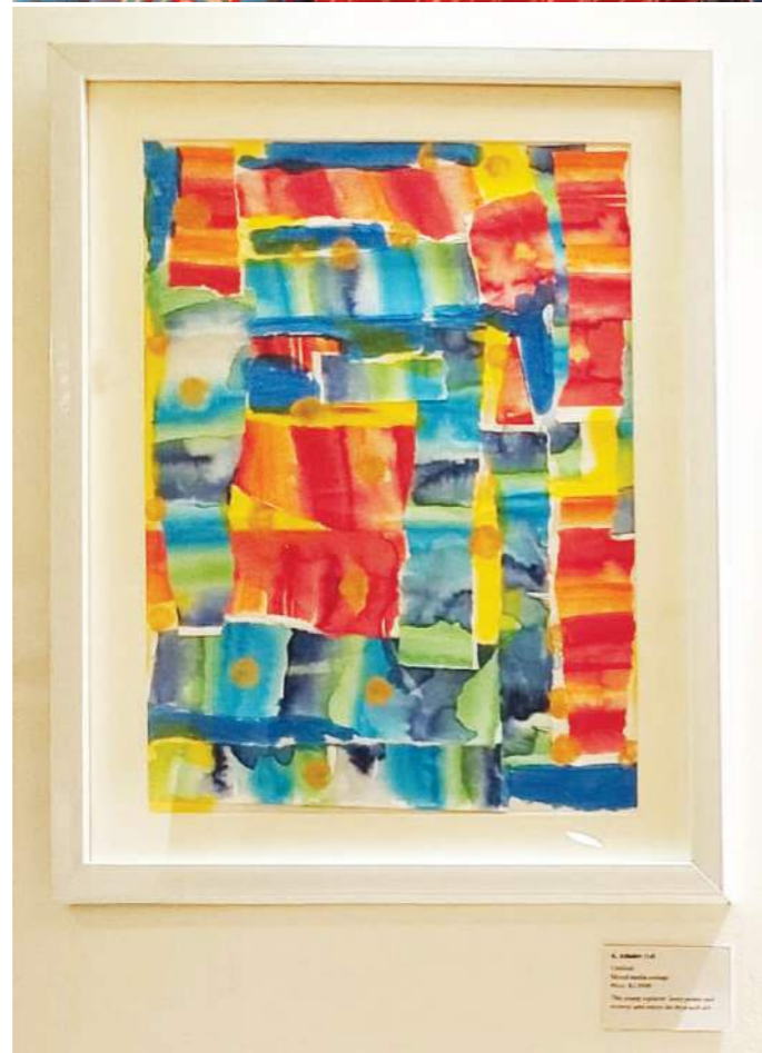
A Athidev – Untitled.