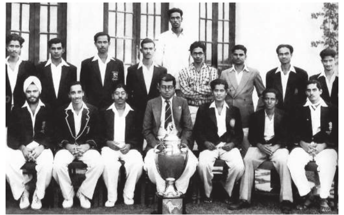
Seated 2nd from left with the winning Madras Ranji Trophy Team, 1954/1955.

My last personal meeting with this grand old man was when he released the book I wrote to commemorate 175 years of the Madras Cricket Club. Covid was then raging and the book, titled 175, Not Out! , was released at the MCC in September 2021 to a limited set of invitees, all masked. The rest of the members saw it via live relay. When it came to the book release, the volume was