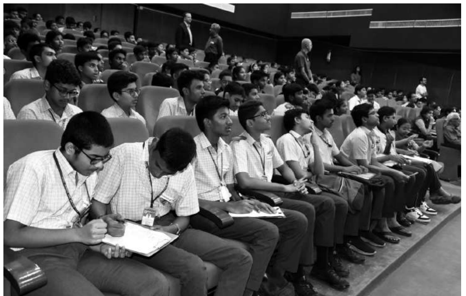
Military History Quiz.