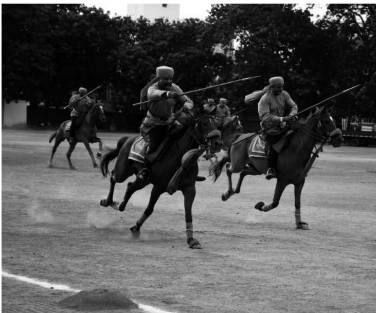
Battle of Haifa — Re-enactment.

A decade on, it stands as a trailblazer in its field — honouring the memory of those who gave their all for the nation, inspiring future generations, and ensuring that the stories of courage, sacrifice, and service are neither forgotten nor overlooked. As it marches into its second decade, the Foundation remains steadfast in its mission: to preserve, promote, and celebrate India's proud military heritage, so that the nation may always remember the price of its freedom.