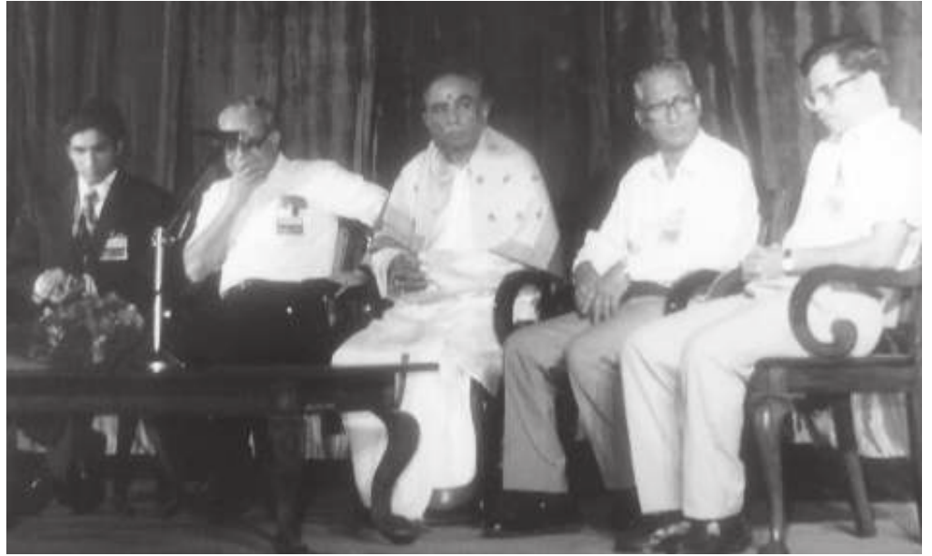
The inauguration ceremony of Mardi Gras 1995 – the final time the festival bore this iconic name before becoming Saarang.

In 1966, the Katyayini Sangeeta Sabha was established as a music club, though it eventually faded away. Around 1970, the IIT Madras Music Club came into being, with its primary mission centred on organising and hosting programmes in Indian classical music. Cultural