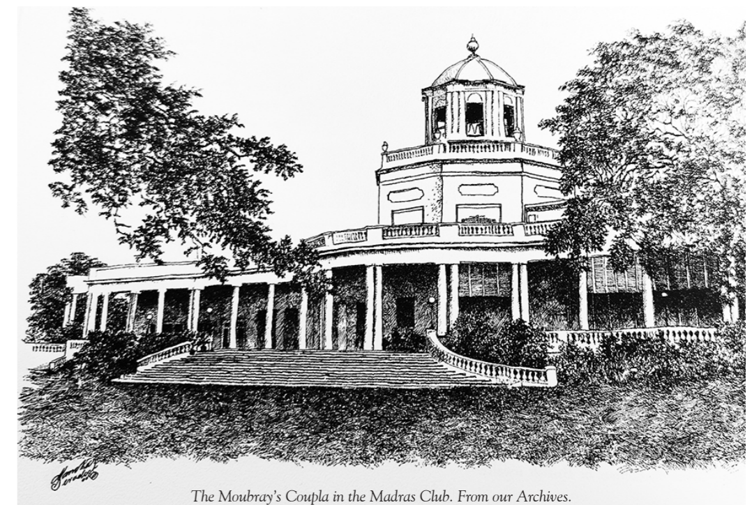
The Moubray's Coupla in the Madras Club. From our Archives.

The airport was small. It was a room with glass windows for people to see out to the planes, and a flat roof where they could stand and wave. Ayah came to