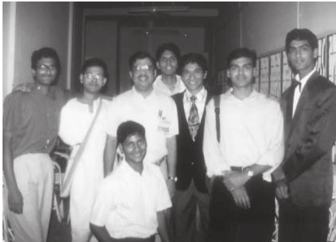
A photograph taken in the green room behind the Open Air Theatre stage in 1995, after a Mardi Gras show.